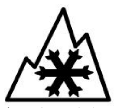
Severe winter traction icon

NOTE: Some newer tires are designed for use in severe snow conditions and are marked on at least one sidewall with the letters "M" and "S" (e.g., MS, M/S, M&S, M+S, etc.) plus have a pictograph of a mountain with a snowflake. If you need more information on tires designed for severe snow conditions contact the CTQP Administrator (at (810) 677-5745) or refer to Rubber Manufacturers Association, Tire Information Service Bulletin, Volume 37, Number 2, February 1999 and titled "RMA Definition for Passenger and Light Truck Tires for Use in Severe Snow Conditions." An example of the mountain/snowflake is shown below.